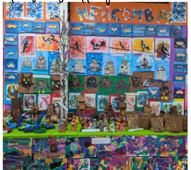
Newcomb artwork Geelong Show