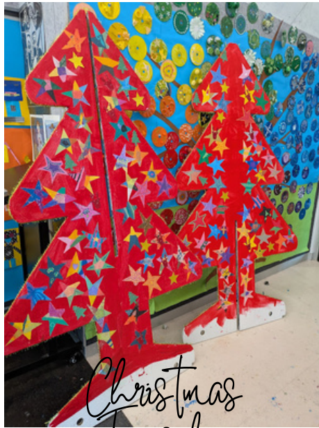
Christmas Trees for Johnstone Park