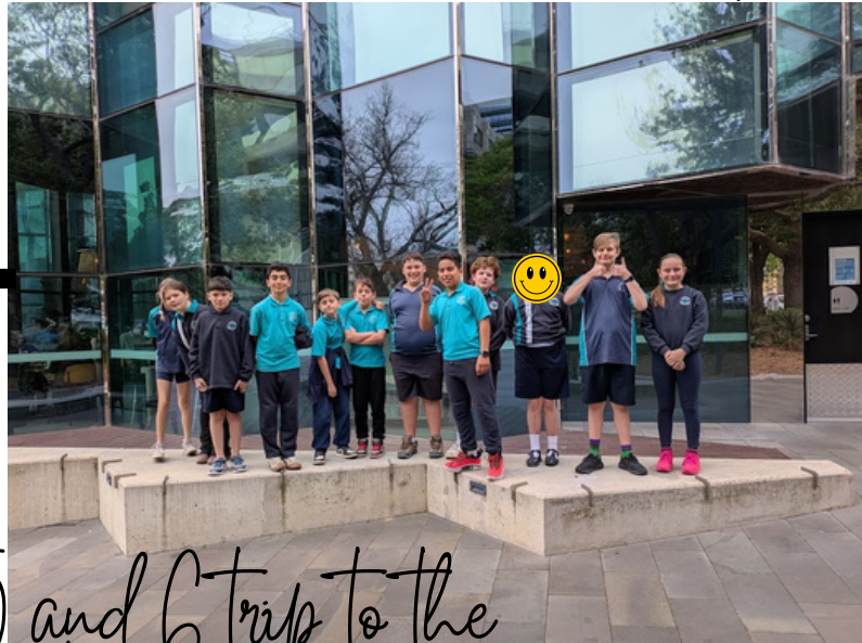
Grade 5 and 6 trip to the Archibald's at Geelong Gallery