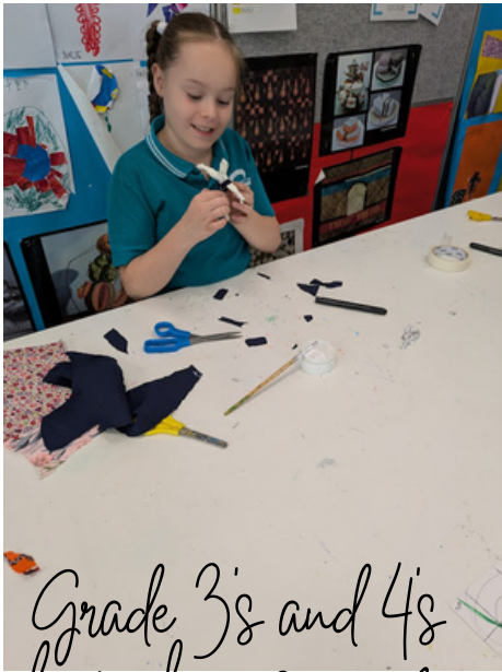
Grade 3's and 4's have been sewing and making foil people ready for animation